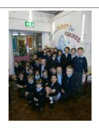
We took part in Cafod's Thirsty for Change campaign.