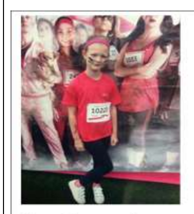
We celebrate and encourage the charity work of our children.

At St. Monica's we promote mutual respect by encouraging caring for others and teamwork.